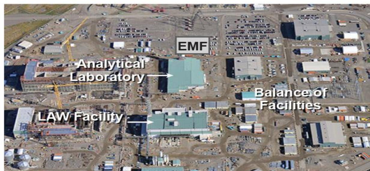
DFLAW Facilities and Interfaces