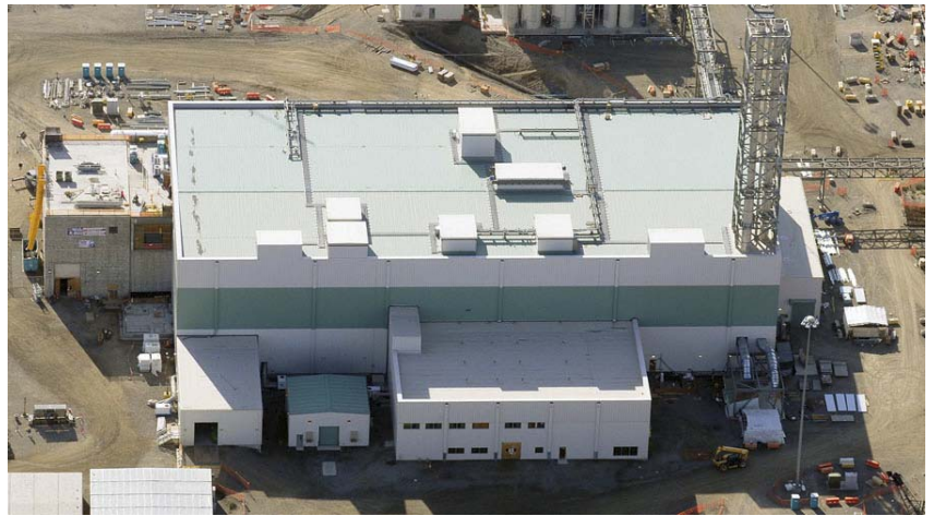
LAW Facility in November 2011

The Hanford Waste Treatment and Immobilization Plant (WTP) will cover 65 acres with four nuclear facilities – Pretreatment, High-Level Waste Vitrification, Low-Activity Waste Vitrification and an Analytical Laboratory – as well as operations and maintenance buildings, utilities and office space.