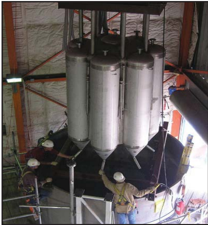
The M3 Mixing Test Platform will be used to confirm the effectiveness of the vit plant's pulse jet mixers.

The last components of a new WTP testing platform arrived in Richland, Wash., at the end of April. The M3 Mixing Test Platform will confirm the effectiveness of pulse jet mixers (PJMs), an essential waste mixing technology that will be used at WTP. Composed of six large components, known as “skids,” the M3 Mixing Test Platform is 36 feet long, 24 feet wide and stands more than 12 feet tall.