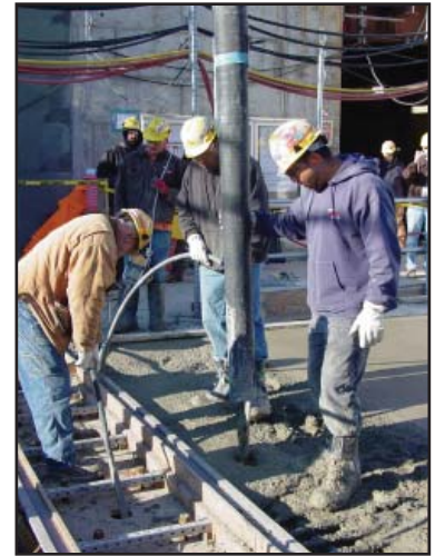
Crews at the High-Level Waste Facility finished pouring concrete at the 0-foot elevation in late April.

When operational, the HLW Facility will process high-level waste by mixing it with glass-forming materials in two 90-ton melters and heating it to 2,100 degrees Fahrenheit. The mixture will then be poured into stainless steel canisters that are approximately 2 feet in diameter, 14.5 feet tall and weigh more than 4 tons.