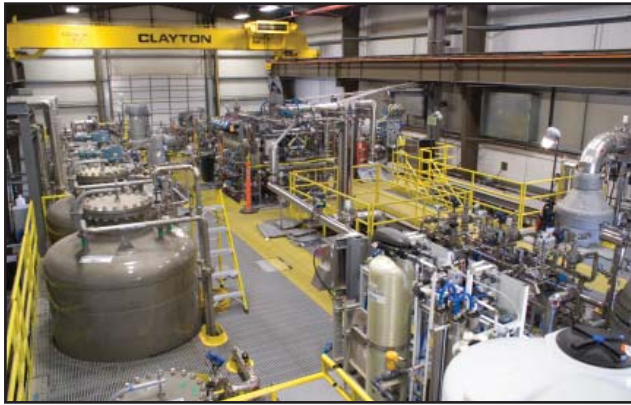
The Pretreatment Engineering Platform is a quarter-scale demonstration facility that was used to confirm key vit plant pretreatment processes.