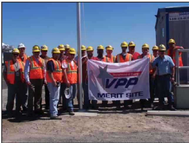
Construction site employees were presented with the Merit flag on April 20.

On April 20, employees at the WTP construction site celebrated the honor of earning the Department of Energy's (DOE's) Voluntary Protection Program (VPP) Merit status, recognizing employee excellence and leadership in safety and health. DOE Office of River Protection Manager Shirley Olinger presented WTP site employees with the Merit status flag and a framed plaque during the celebration.