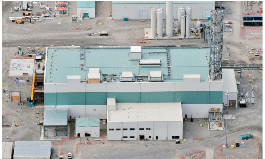
LAW Facility in June 2009

Construction of the WTP began in 2002. The plant will be operational in 2019.