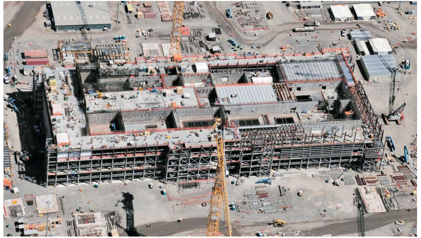
PT Facility in July 2010

The Hanford Waste Treatment and Immobilization Plant (WTP) will cover 65 acres with four nuclear facilities – Pretreatment, Low-Activity Waste Vitrification, High-Level Waste Vitrification and Analytical Laboratory – as well as operations and maintenance buildings, utilities and office space.