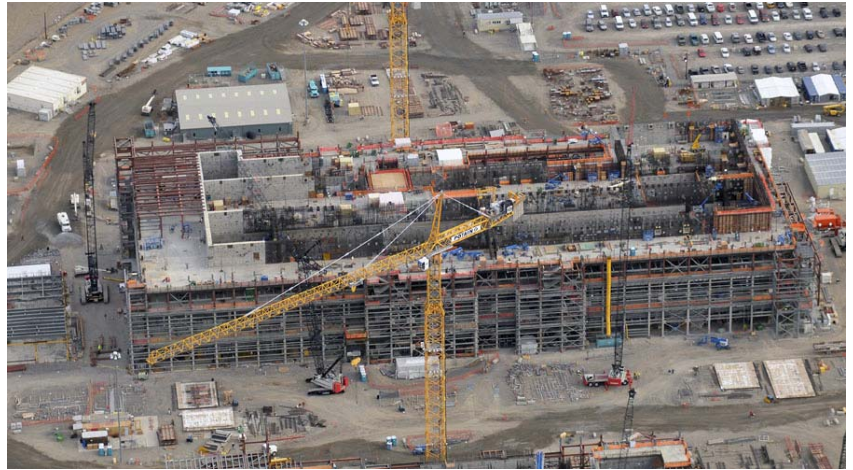
PT Facility in April 2011

The Hanford Waste Treatment and Immobilization Plant (WTP) will cover 65 acres with four nuclear facilities – Pretreatment, Low-Activity Waste Vitrification, High-Level Waste Vitrification and Analytical Laboratory – as well as operations and maintenance buildings, utilities and office space.