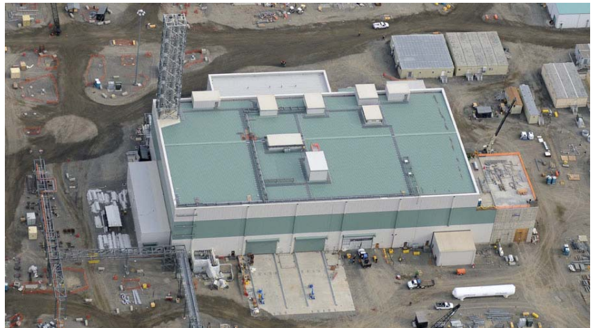
LAW Facility in April 2011

Construction of the WTP began in 2002. The plant will be operational in 2019.