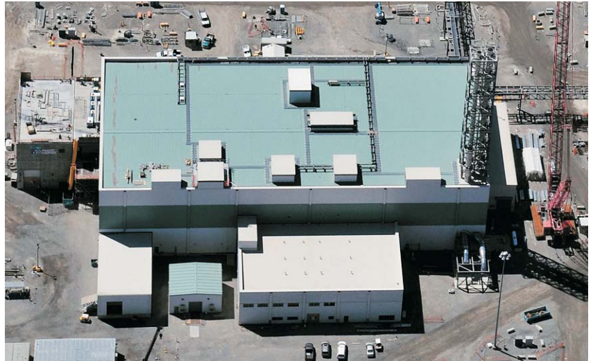
LAW Facility in July 2010

The Hanford Waste Treatment and Immobilization Plant (WTP) will cover 65 acres with four nuclear facilities – Pretreatment, Low-Activity Waste Vitrification, High-Level Waste Vitrification and Analytical Laboratory – as well as operations and maintenance buildings, utilities and office space.