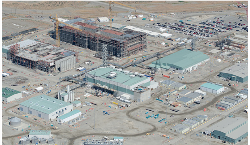
The Vit Plant

Electrical cable: 5,351,000 feet, if laid end-to-end, would stretch more than 1,013 miles